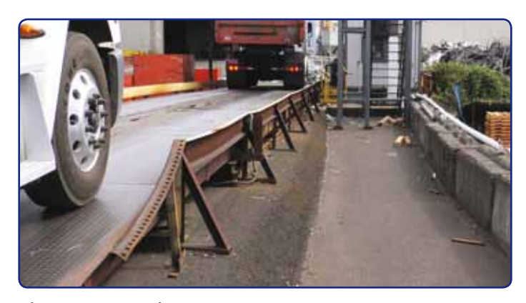
The previous scale

For more information on Calbag Metals, visit www.calbag.com . To learn more about the SteelBridge IMXT or other Avery Weigh-Tronix truck scales, visit www.wtxweb.com .