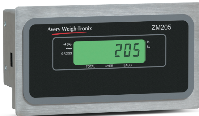
ZM205 Passenger Display