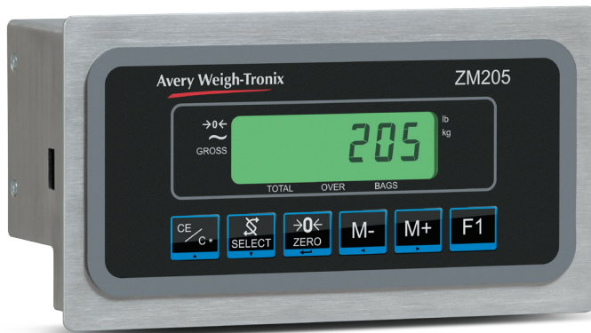
ZM205 Operator Display