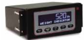
Desktop Panel Mount