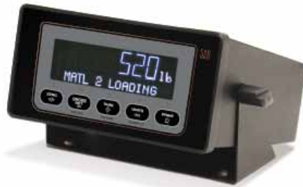
The 520 guides operators through weighing processes with a 16-character prompting display that can be programmed with up to eight different messages. Desktop model shown.

The 520—delivering process control solutions for today... and beyond.