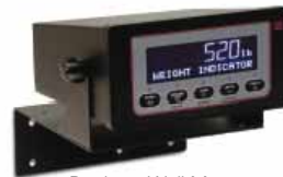
Desktop Wall Mount