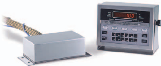
The IQ 700 IS shown with intrinsically-safe power supply.

In dangerously-explosive and dimly-lit environments, the FM-approved, intrinsically-safe IQ 700 IS shines as the indicator of choice. From the big and bright